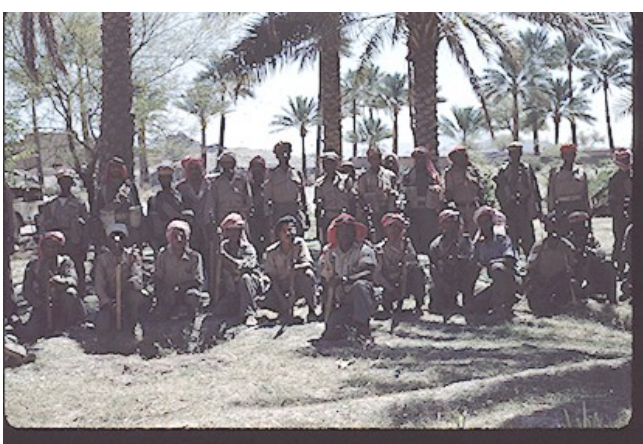
Venoms at Sharjah