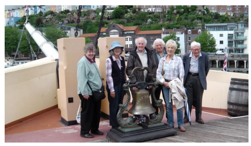
On deck the SS Great Britain

Then it was time to go on board. What an amazing afternoon we had, exploring this huge vessel, designed by Brunel and launched in 1843 as the world's largest iron-hulled ship. She had three lives – first as a passenger liner to the USA and Australia, then as a windjammer sailing ship plying between America and England and finally as a cargo vessel transporting coal to and wheat from the USA west coast. Storm damaged at Cape Horn in 1886, she limped into the Falklands, where she remained, until a remarkable salvage operation brought her back to Bristol in 1970.