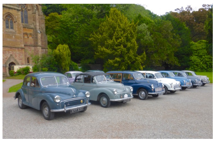
Morris Minor Rally at Tyntesfield