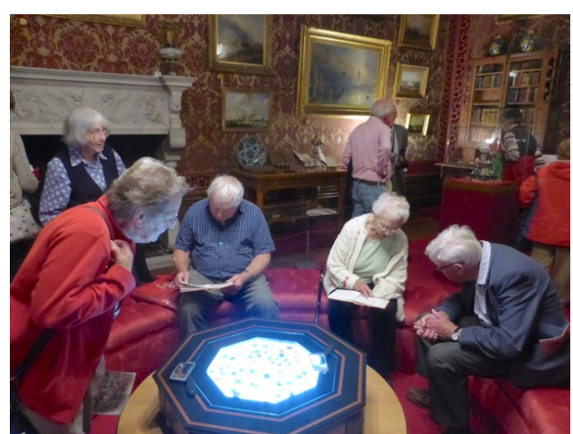
View of Tyntesfield House