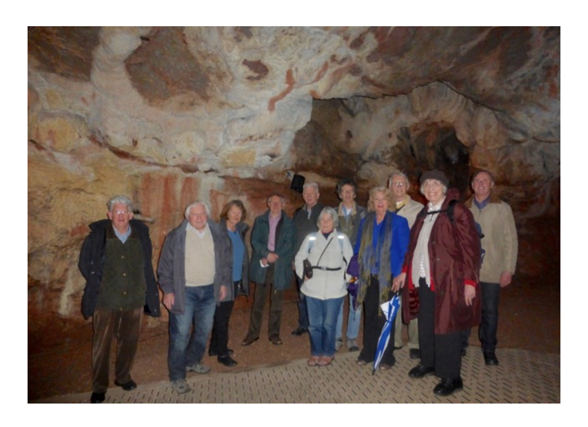
Our group inside the cave at the start of our tour. We all wore our anoraks as the cave remains at a cool 14°C all year round.