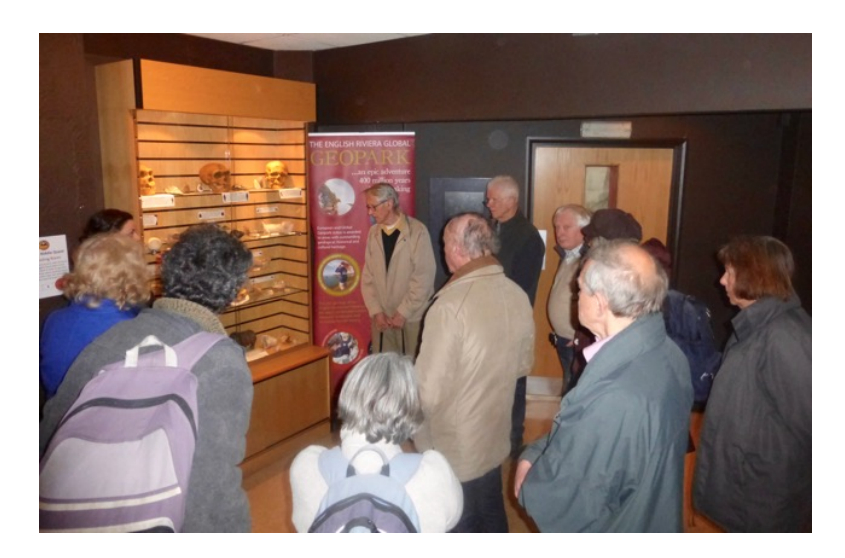
Introduction to the cavern and its history, showcasing the finds that are displayed. These are just a small fraction of the many thousands discovered.

where the only available lighting was through candles.