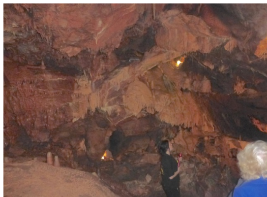
Yet deeper into the cavern where we entered numerous chambers on our circular tour.