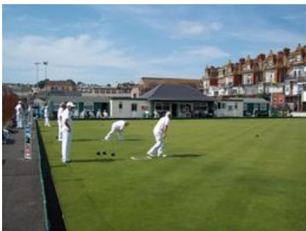
Paignton Torbay Bowling Club

Meet: at the Paignton Torbay Bowling Club from 10.00 am.